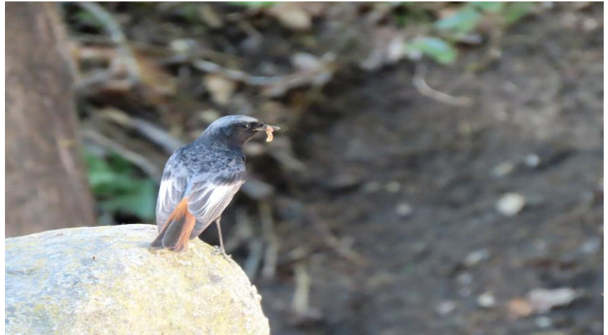
A Black Redstart pauses on a sarcophagus lid while feeding its young in the Alyscamps.

Just across the road is the hospital of St-Paul de Mausole. The small Romanesque church at the institution's center has an attractive cloister with handsome capitals and a riotously colorful flower garden. St-Paul is most famous, however, as the asylum where Vincent van Gogh resided after that trouble with his ear in Arles. The barred window of his tiny room looks out over endless olive groves and beds of blooming iris. Inspired by their great predecessor, the current patients display their own artwork in the gallery just off the peaceful cloister. The calm, quiet hospital grounds are a good place to look for European Robin, Common Blackbird, and Crested Tit. We should arrive in Arles with time for a short break before dinner.