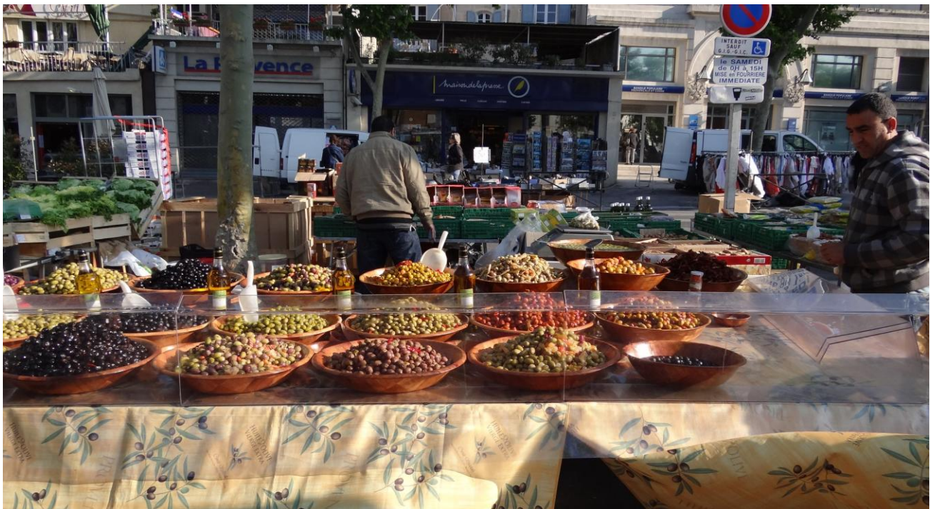
Olives at the Saturday Market.

May 7, Day 7: The Saturday Market and La Crau. Arles's weekly market stretches for almost a mile and a half up and down the Boulevard des Lices. Olives, mattresses, exotic spices, cheeses, poultry, silk scarves, wines, shellfish, honey, shoes, fruit, soap, sausages, cookies, cakes, and just about every local and regional delicacy imaginable can be found here. Accordingly, lunch today is on your own; the leaders