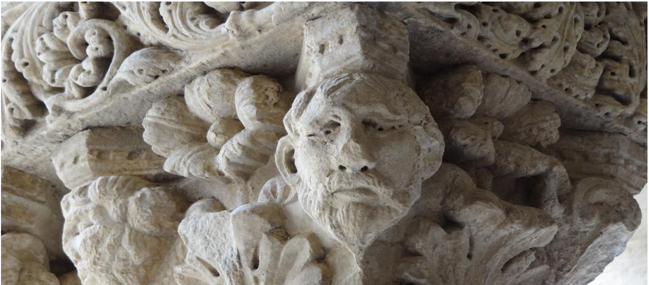
In the cloister of St. Trophime

productive birding sites in Europe, we will be looking for all of the French heron species, along with the Mediterranean Gull, Whiskered and Gull-billed Terns, Zitting Cisticola, and Great Reed Warbler. White Storks, ever more common in the area, may already have re-occupied their enormous nests, and Nightingales and Cetti's Warblers shout their songs all day long from the tamarisks. On a rambling walk along the quiet Cacharel Road, we will be keeping an eye and an ear out for such uncommon species as the Bearded Reedling, Great Spotted Cuckoo, and Woodchat Shrike. This is prime habitat, too, for black Camargue bulls and for white Camargue horses, which we are likely to see both in paddocks and roaming free across the marshes.