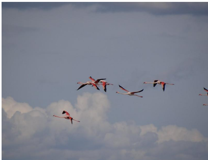
The Greater Flamingo is a classic inhabitant of the salt marshes of Mediterranean France.

Arles is also the gateway to some of the best wildlife areas in France. On some days of our trip, birding will predominate, while other times will be devoted primarily to historical sites, but most of our outings will feature a balance between birds and culture. Late morning starts, leisurely meals, and plenty of time built in for shopping, strolling, or enjoying the sights ensure a relaxed pace, and the food, the wine, and the inviting landscapes of Provence combine to make this an especially appealing European sojourn for birders and non-birders alike.