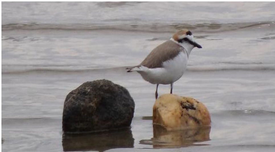
Kentish Plover.