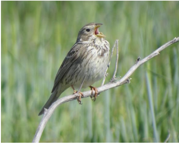
A Corn Bunting on La Crau.

May 8, Day 8: The Western Camargue. After what is likely to have been an exhilarating evening on La Crau, we will make a slightly later start this morning. Some of us may choose to linger over breakfast in the hotel, while others might want to seize the chance for a little exploration on their own of the inexhaustible riches of the Arlesian cityscape. From the astonishing Romanesque beauty of the church of St. Trophime to Frank Gehry's equally striking LUMA tower, there is something new (or something very old) around every corner. Our minibus will meet us in the late morning for an excursion into the Western Camargue, north of Les Saintes-Maries-de-la-Mer on the shores of the vast Fangassier flats. Here, at one of the most consistently and most impressively