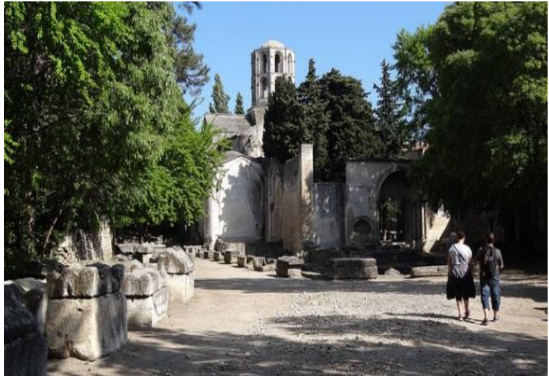
The Alyscamps.

After breakfast in our hotel, we will begin this morning with a drive to the Pont du Gard, an imposing Roman bridge and aqueduct built early in the first century AD. Not just a marvel of engineering, the pont is also the nesting site for large numbers of Common and Alpine Swifts and Crag Martins; the rocky shores of the river Gard beneath are often haunted by White Wagtail, Little Egret, and Yellow-legged Gull. If the morning is warm, raptors rise out of the woods across the river; Short-toed Eagles and European Honey Buzzards are regularly seen here, and some recent tours have been fortunate enough to see Eurasian Griffons low overhead.