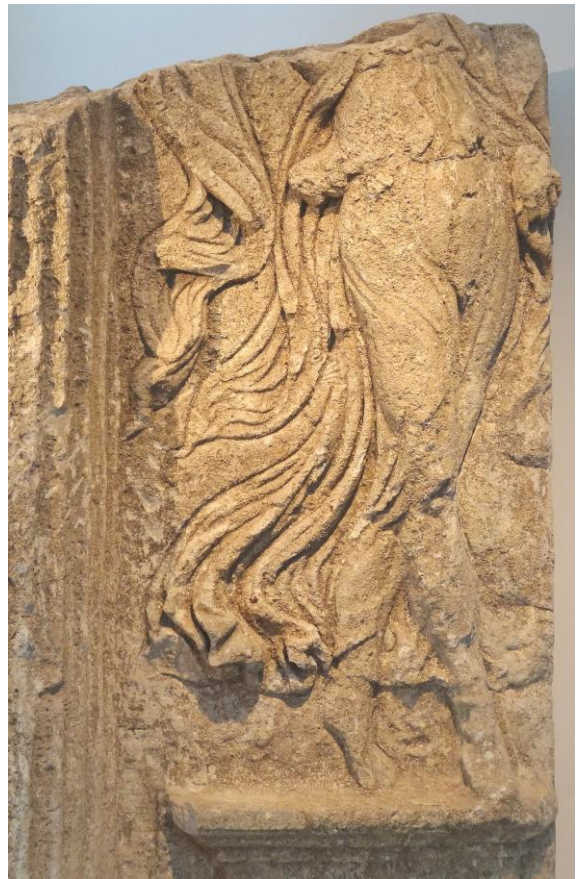
The stunning relief of a female dancer from the Roman theater of Arles, now in the Musée de l'Arles antique.

We will have lunch in nearby Albaron or St. Gilles, then return to Arles. Those who wish can visit the wonderful Musée de l'Arles Antique, an unequalled collection of artifacts of life and death in Greek, Roman, and Early Christian Gaul. Sculptures, trade goods, mosaics, and even a wooden ship sunk in the Rhone in the middle of the first century AD are on display; almost all of the objects are from Arles itself, including statues from the Roman theater, sarcophagi from the Alyscamps, and elegantly tiled floors from patrician houses. As a bonus, the trees along the river here are often very attractive to birds, and we will be sure to check those and the Roman-inspired gardens surrounding the museum for resident breeders and newly arrived migrants.