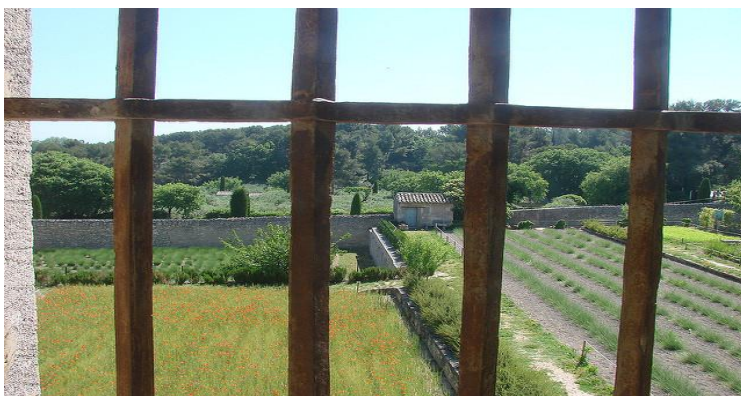
St-Paul de Mausole.

May 6, Day 6: Les Baux and van Gogh. The dramatic limestone hills of Les Alpilles stretch across the horizon just north of Arles, their flanks clad in olive groves and woodlands. Our first destination is Les Baux, a hulking medieval fortress perched high on the cliff above the deep, dark, evocatively named Valley of Hell. The self-styled “lords” of Les Baux terrorized the countryside through much of the Middle Ages. Later, Les Baux was a refuge for French Protestants. In 1632, Richelieu turned the cannons of France on their stronghold, leaving much of the once impregnable fortress in ruins.