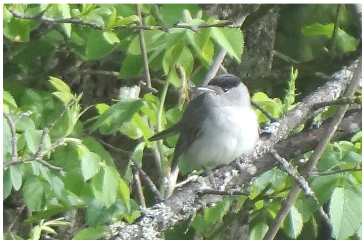
The male Blackcap, his somber plumage notwithstanding, sings the most beautiful song of any European bird.

NIGHT (Day Two): Crowne Plaza Marseille – Le Dôme Hotel, Marseille