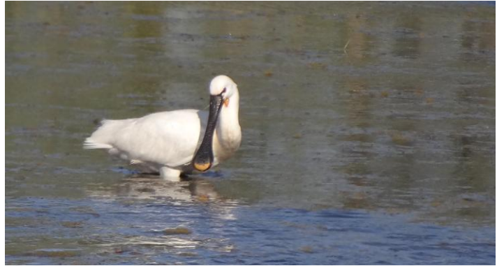
Eurasian Spoonbill at Pont de Gau

May 9, Day 9: Pont de Gau. Half an hour south of Arles, the Parc ornithologique Pont de Gau was founded seventy-five years ago as a zoo and rehabilitation center for the birds of the French Mediterranean. Beginning in the 1970s, the organization's focus shifted to habitat preservation, and the Parc now owns and manages eighty acres of wild marsh, accessible along four miles of broad, level trails. More than 250 species of wild birds have been seen here, a respectable tally even by the exalted standards of the Camargue. What is most exciting, however, is the opportunity to see many otherwise furtive species at sometimes remarkably close range, from well-placed blinds, observation towers, and even right from the path, where Black-winged Stilts and Pied Avocets nest on islands just a few feet from the human visitors, and several species of normally secretive herons and Glossy Ibis occupy noisy breeding colonies almost all year round. Even skulky passerines can be easy to get a glimpse of here; this is the best place in the region to actually see such noisy but shy songbirds as the Cetti's and Moustached Warblers and the Common Nightingale.