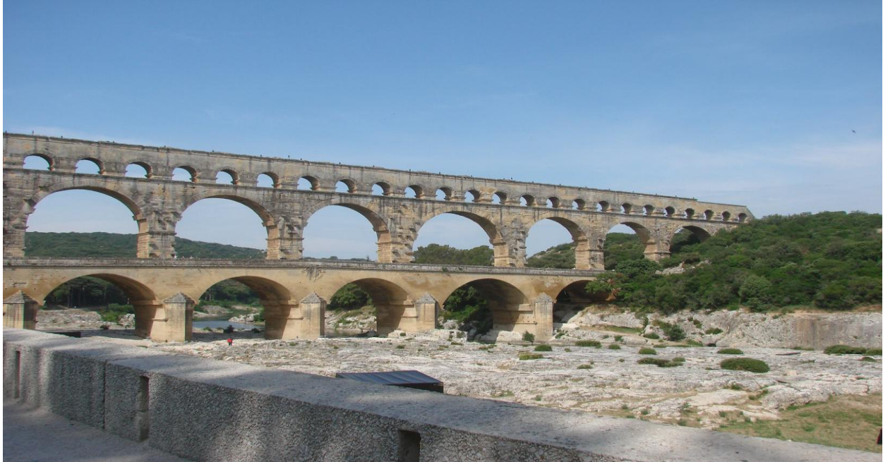
The Pont du Gard, one of the famed marvels of Roman engineering.

Fields and lawns in the area can be good for migrants and resident birds. Unless the spring is late, Eurasian Hoopoe can be common, and this is a nearly reliable spot to not just hear but actually see the stunning Golden Oriole. While Black Redstarts will quickly become a familiar sight; seen everywhere there is a wall or a rock, the woods around the pont and visitor center are often our best chance for good looks at the poorly named Common Redstart, a bird of decidedly uncommon beauty. Serins, Greenfinches, and Cirl Buntings are sometimes conspicuous in the brush-lined parking lots.